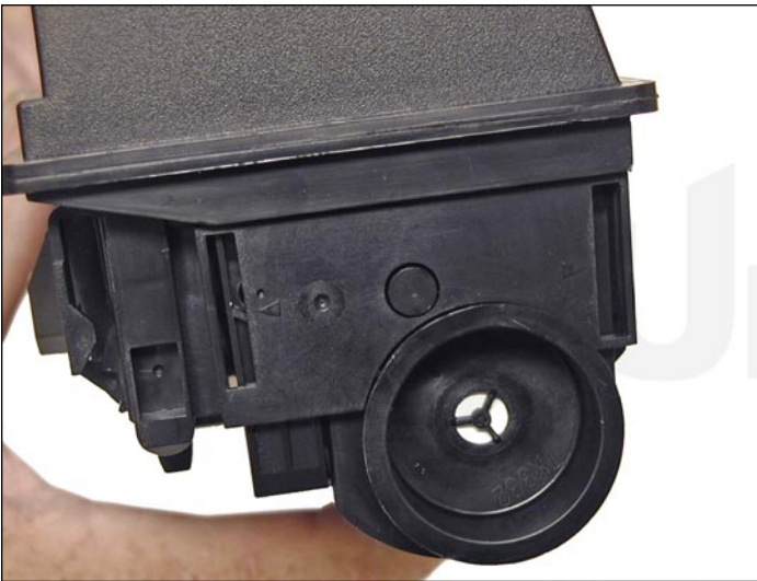
3. Re-install the fill plug.