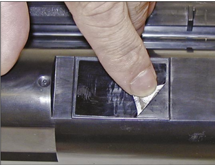
5. Replace the RF type chip (the chip is manufactured into the label).