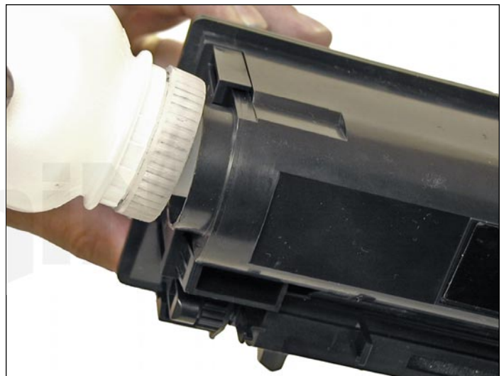
2. Make sure the toner port is closed.