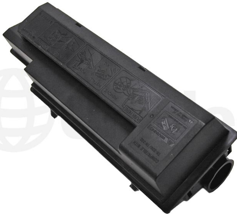
KYOCERA TK-332 SERIES TONER CARTRIDGE