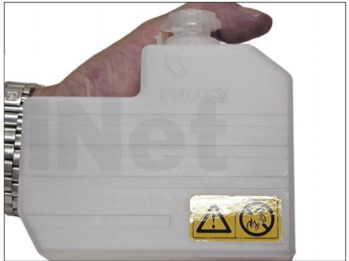
4. Clean out or replace the waste bottle.